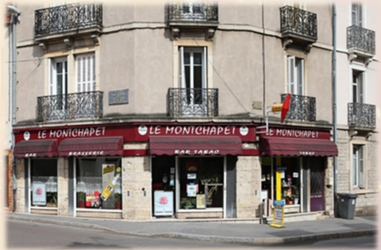
42 Rue de Montchapet, now Café Le Montchapet, the place where what became known as first Kir was mixed.