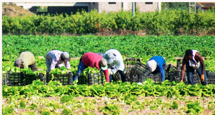
Salinas Valley farmworkers (File image)